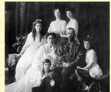
Tsar Nicolas II and family

The third part of the secret, the one which has generated so much controversy, was revealed publicly only after the assassination attempt on the life of John Paul II. Sister Lucia wrote: “And we saw in an immense light that is God: ‘something similar to how people appear in a mirror when they pass in front of it’ a Bishop dressed in White, ‘we had the impression that it was the Holy Father.’ Other Bishops, Priests, men and women Religious going up a steep mountain, at the top of which there was a big Cross of rough-hewn trunks as of a cork-tree with the bark; before reaching there the Holy Father passed through a big city half in ruins and half trembling with halting step, afflicted with pain and sorrow, he prayed for the souls of the corpses he met on his way; having reached the top of the mountain, on his knees at the foot of the big Cross he was killed by a group of soldiers who fired bullets and arrows at him, and in the same way there died one after another the other Bishops, Priests, men and women Religious, and various lay people of different ranks and positions. . . .”